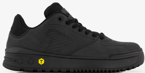
DENTON BLACK S1P CI HI HRO SRC | 2021-001 | 39-46