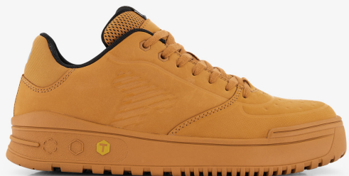
DENTON WHEAT S1P CI HI HRO SRC | 2045-020 | 39-46