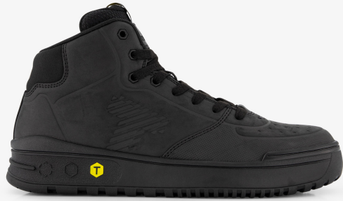
DENTON MID BLACK S1P CI HI HRO SRC | 3021-001 | 39-46