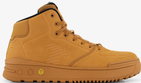
DENTON MID WHEAT S1P CI HI HRO SRC | 3045-020 | 39-46